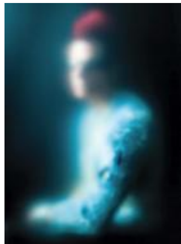
Out of the River of Time