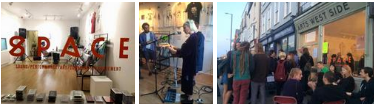
Howling Owl Records