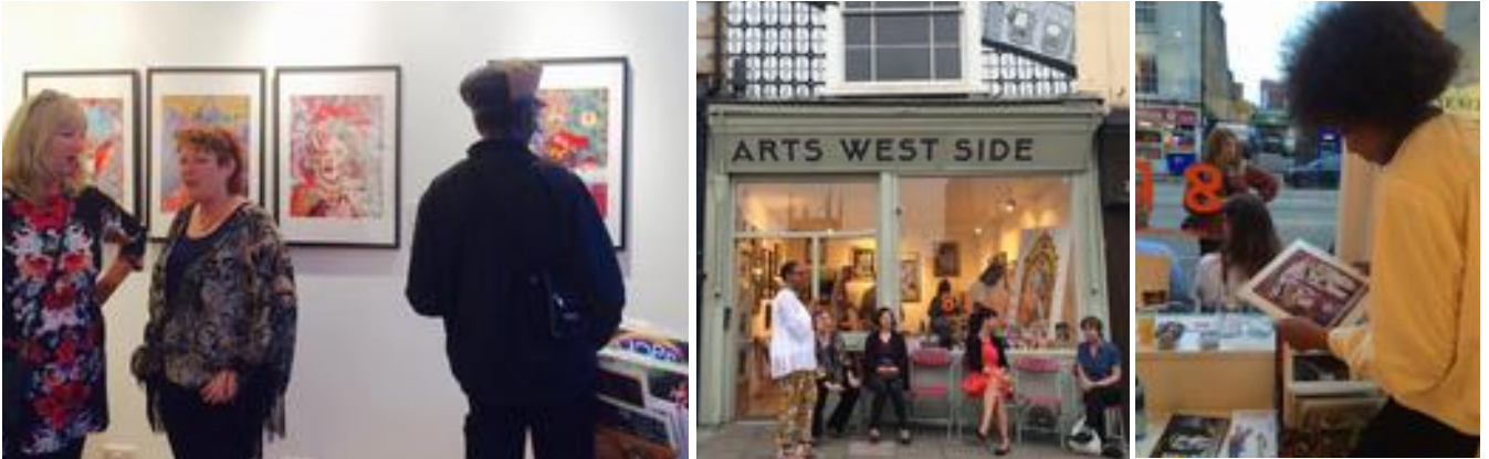
The Weird and the Wonderful