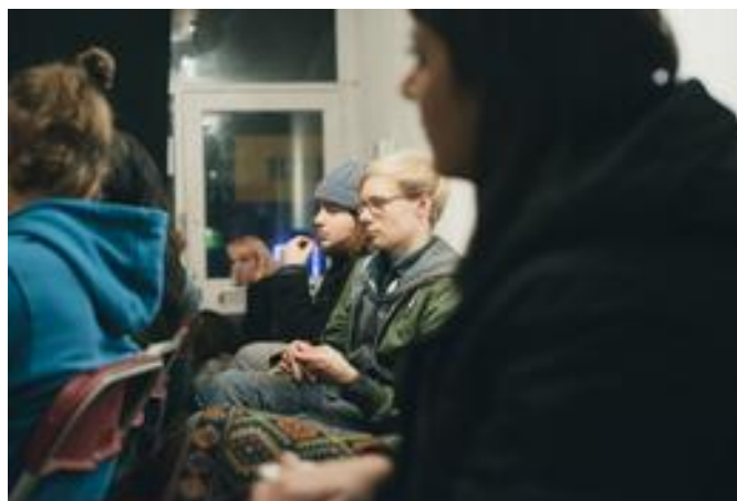
Back Scratcher #2

A platform for contemporary performance, dance and live art where individuals, or groups of any size present their work in early stage.