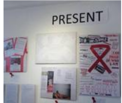
Black Van Publishing, Back Scratcher, World Aids Day