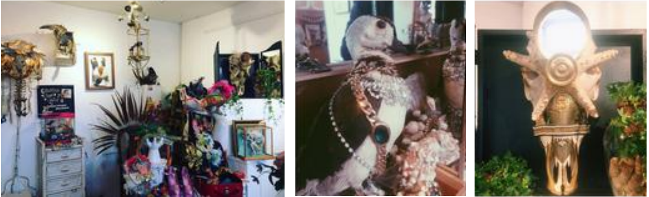
Near Death Experience