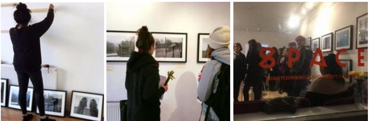
Women from Here

See it From Her (SIFH) photography exhibition by women who were part of The Bourke-White Programme, a 1-1 mentoring programme for women in Bristol (including those who are gender fluid, non-binary and trans women).