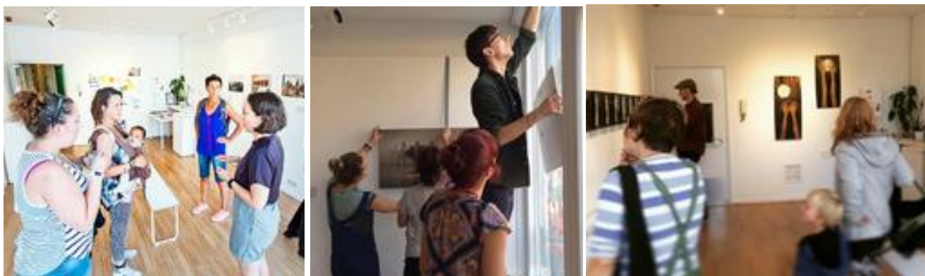
Bristol Doors Open Day, 11 Million Reasons, Now Where