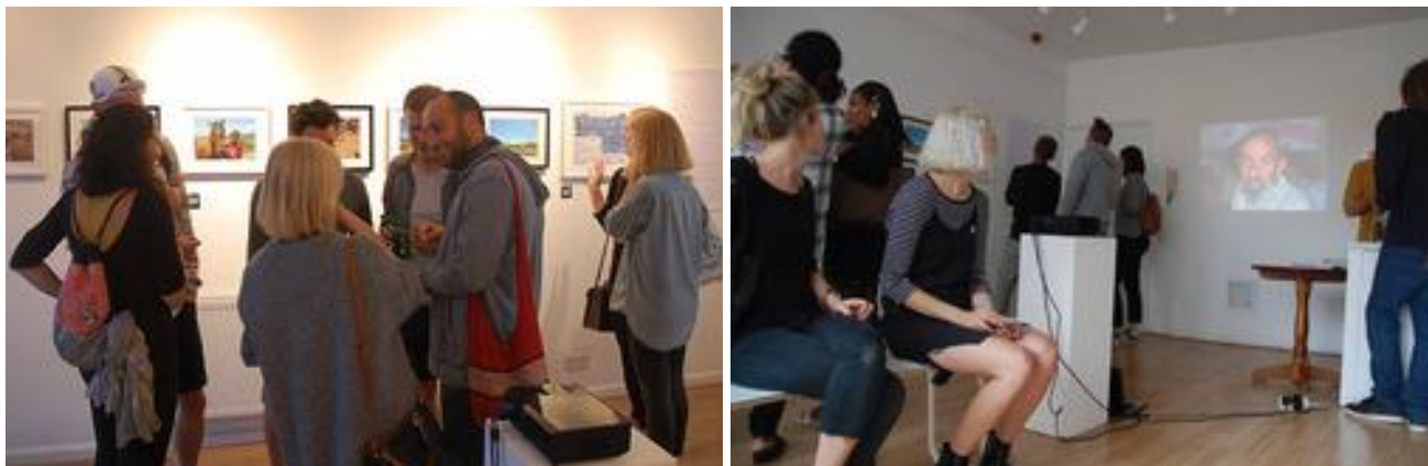
Pirita: The Gypsy Slums

“Thank you everyone for coming. It was wonderful to hear such wonderful comments about the girl's photography work. One visitor commented 'It is so beautiful to see Gypsies being represented as human for once' another said 'It has made me tearful to see this work. It was so moving'. SIFH