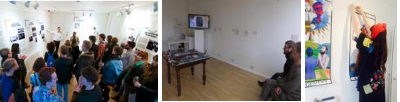
SPACE Launch, The Complete Works on Shakespeare, Tarot de Berlin