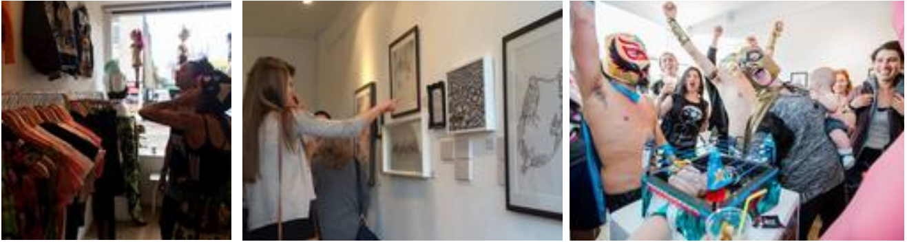
LG World, L'appel du Vide, Deep inside I'm a Wrestler